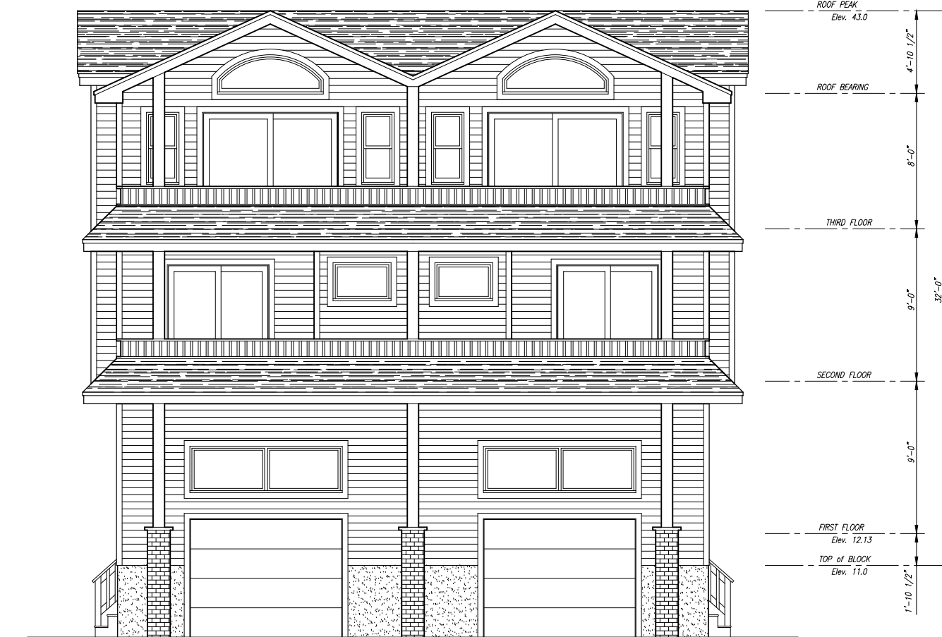
FRONT ELEVATION SCALE: 1/8" = 1'-0"

The FLOOR PLANS and EXTERIOR VIEWS PRESENTED in this EXHIBIT REPRESENT a CONCEPTUAL DESIGN and ARE SUBJECT to ENHANCEMENT and REFINEMENT DURING the DESIGN DEVELOPMENT and CONSTRUCTION DOCUMENTATION PHASES of the PROJECT