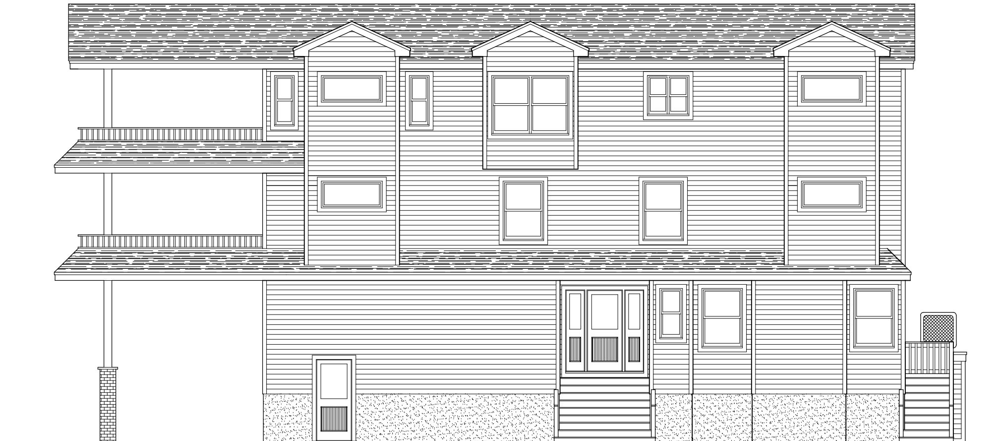
RIGHT SIDE ELEVATION SCALE: 1/8" = 1'-0"